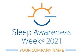
Do not modify, crop, or add to the logo in any way. For example, do not ever remove the "powered by the NSF" line from the logo.