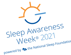
Do not rotate the logo.