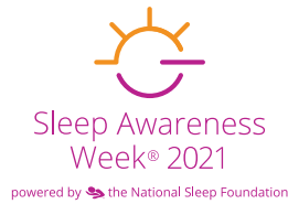
Do not change the font style, font color, or logo color.