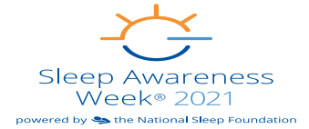
Do not stretch, distort, or change the logo's proportions.