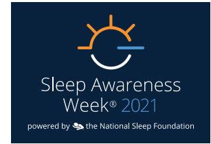
Full color knocked out, vertical for dark backgrounds