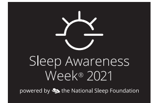
Single color, vertical for dark backgrounds