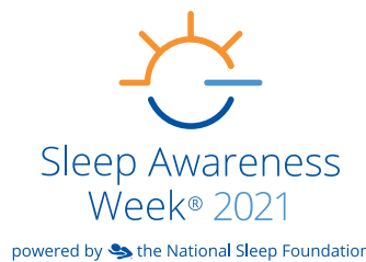
min. 1.75" for print min. 150 px for digital

For readability purposes, the logos should not appear smaller than the recommended minimum sizes listed to the right.