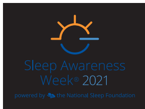
Do not use the full color logo on a dark background. In this case, the full color knocked out logo should be used (see approved example above).

To maintain visual consistency, remember to follow the Proper Logo Use guidelines. The following are examples of incorrect Sleep Awareness Week logo usage.