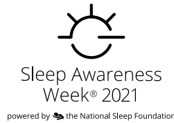
Single color, vertical for light backgrounds