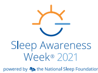
Do not make the logo smaller than the minimum size requirements.