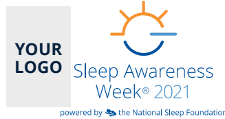
Do not allow any other elements, for example, your company logo, to encroach on the logo's protected clear space. See below for guidelines on how to pair your logo with the Sleep Awareness Week logo.